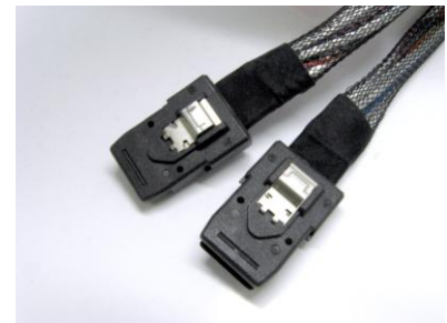
AMPH-8787-XXX: SFF-8087 to SFF-8087 Cable with XXX as the standard or customized length in cm

TEST RESULT AND RECORD Temperature: 23.2 °C